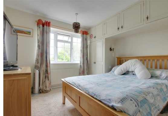
Bedroom One 12'3 10'6 (3.73m 3.20m)